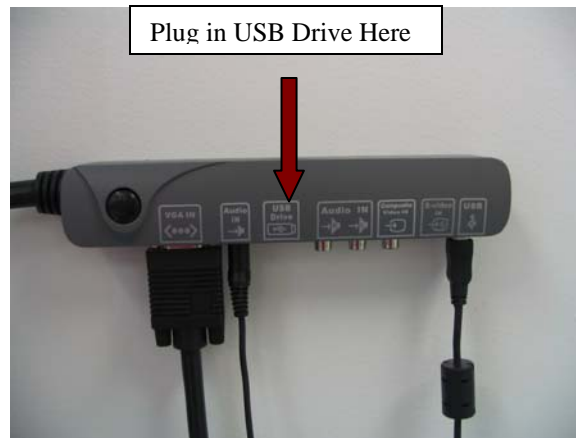
Figure 3 – Accessory Bar